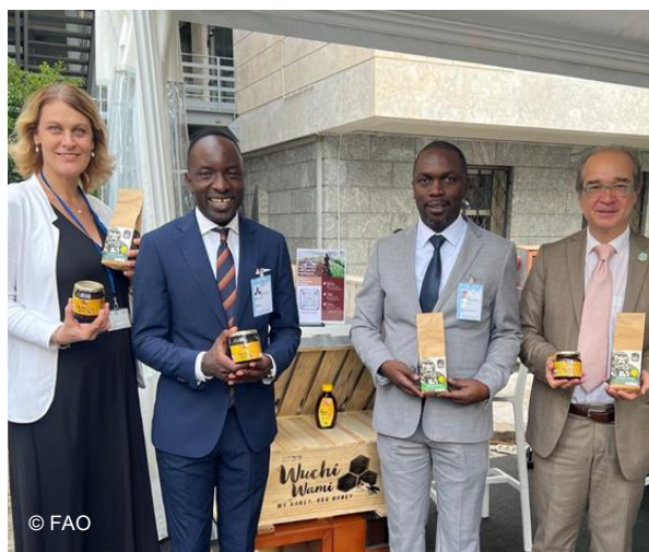
2023 World Food Forum: Science and Innovation Forum; exhibition and presentation; 2 enterprises