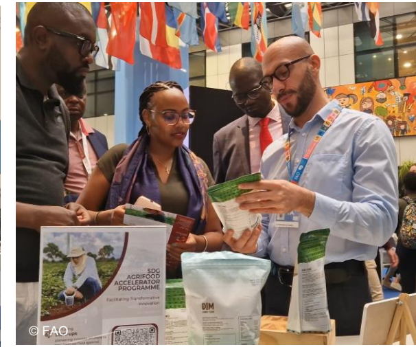
Advocacy workshop: The Agrifood Innovation Finance Debate ; 4 enterprises