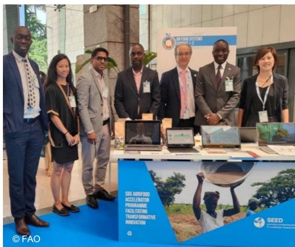
UN Food Systems Summit Stocktake (UNFSS+2): exhibition and dedicated side event; 6 enterprises