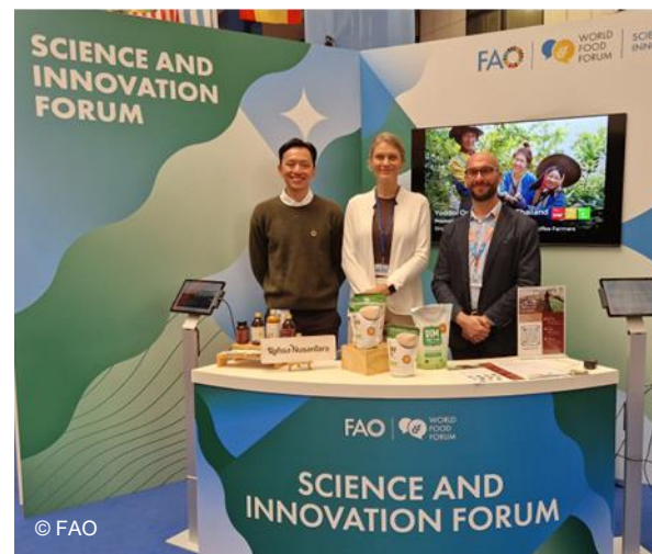
2024 World Food Forum: Science and Innovation Forum; exhibition; 2 enterprises